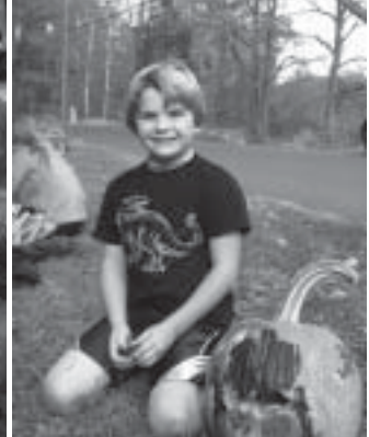
Pumpkin Carving Time in Carversville is just around the corner!

Sunday, October 26 from 2 to 4 p.m. in the Meadow beyond the Inn