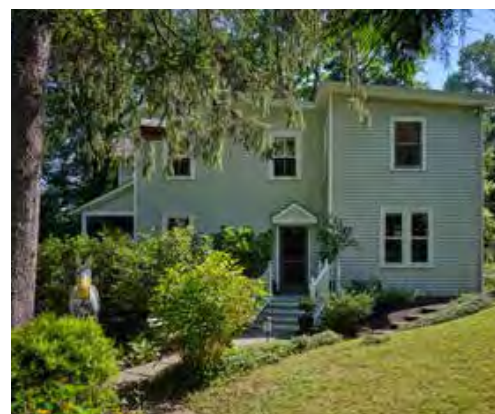
THE LIZZIE BISHOP HOUSE